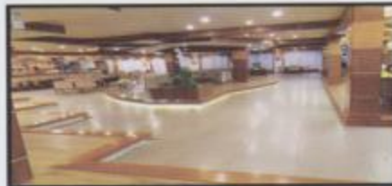
Coffee Shop hall (capacity of 75 pers)