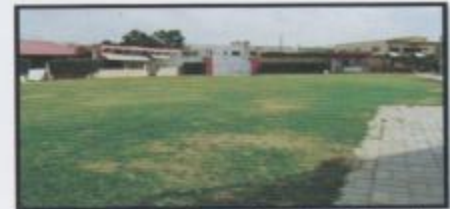
Sports Lawn (capacity of 300 Pers)