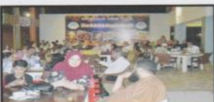
Rooftop Bar B-Q (capacity of 150 pers)