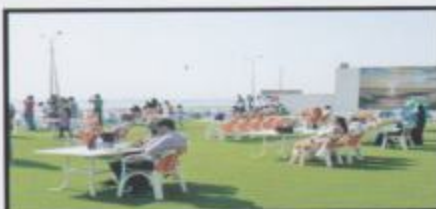
Elevated Lawn (capacity of 250 pers)