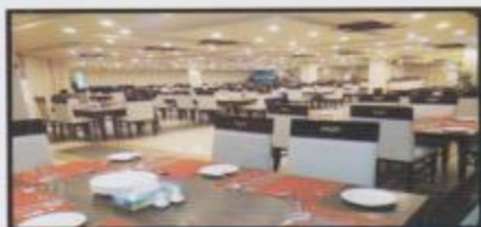
Dining Hall (capacity of 200 pers)

May it be a Wedding Party, Birthday Party or Get together of family and friends, your Club has excellent facilities and best dining choices. We have renowned caterer and decorator on our panel. Therefore our esteem members are requested to allow us to arrange their events / parties at DABVC, their second home, but second to none. This will not only make your events / parties more colorful and memorable but will also benefit the Club financially.