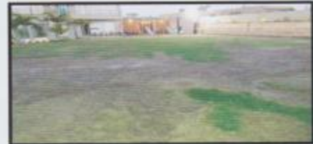
Event Lawn capacity of 150 pers (Size: 60' x 90')